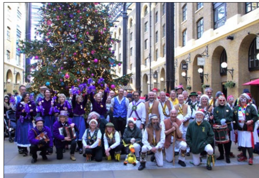
NORTH WOOD MORRIS CELEBRATING THEIR 50TH BIRTHDAY DECEMBER 2024